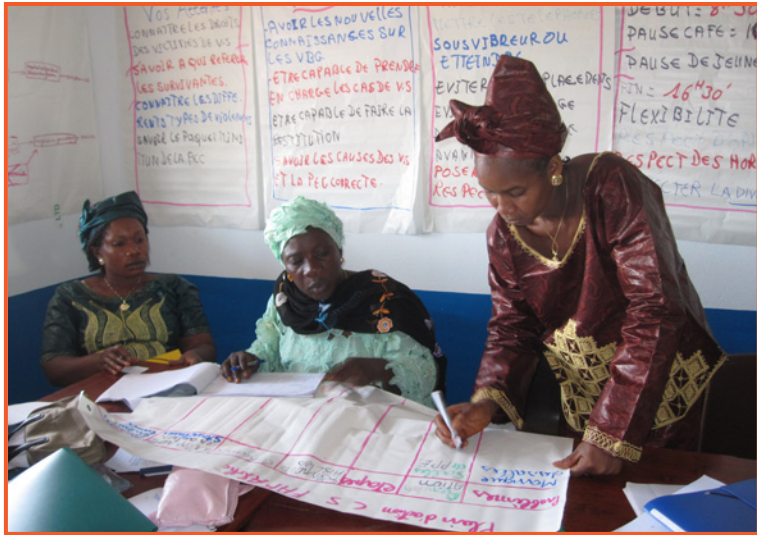
Health care providers in Labé developing an action plan during the training.

Training participants also provided feedback on the training itself, using Likert scales to rate different aspects of the training (on a scale of 1 to 5, 1 indicated strong disagreement and 5 indicated strong agreement). The lowest average rating (3.8) was for the statement: “Five days of training were sufficient to learn how to offer quality services to survivors of sexual violence.” The statement with the highest average rating (4.9) was: “I will put into practice what I learned in this training.” All of the other statements received ratings above 4.4. In addition, participants rated the quality of each training session on a scale of 1 (minimum) to 5 (maximum). All sessions received a rating of at least 4.4.