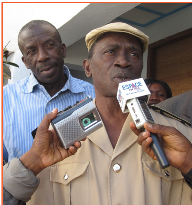
The Governor of Labé, Mr. Sadou Keita (right), presided over the closing session of the health care provider training. The session was broadcast on Guinean national radio.

Following the two trainings of health care providers, RESPOND improved the curriculum based on feedback from providers and facilitators. The MOH led a workshop to revise and validate the provider curriculum. RESPOND is making the final formatting changes suggested, and the MOH will adopt the curriculum as its own national SV curriculum. Previously, the MOH had a protocol for the care of SV survivors, but no curriculum for training providers. The MOH is seeking support to scale up training across the country with this curriculum.