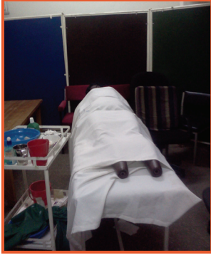
Skills lab set up for a demonstration