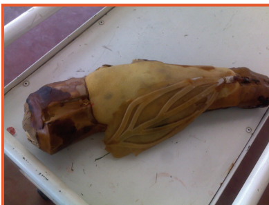
Arm model used at one of the skills labs

In addition, access to anatomical models is severely insufficient. Of the nine public-sector MTCs that participated in the assessment, only five had one or two models for IUCD insertion and removal. One student reported, “The model is plastic, and it is now torn; you can’t practice on it.” Public facilities that did not have models reported that they borrow them from a nearby decentralized training center. Only one of nine public-sector MTCs had an appropriate arm model for implant insertion and removal. None of the NGO training institutions had a model for IUCD insertion and removal or an arm model for implant insertion and removal.